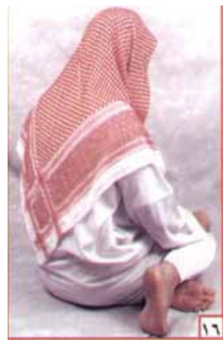
Tawarruk Position -

In the prayers of the three or four rak'ah type, after finishing the second rak'ah and the first tashahhud , stand up raising your hands (as described earlier) and say, "ALLAAHU AKBAR." When you reach the straight standing position, recite the Faatihah and go for the prostrations as done earlier. If you are praying the three rak'ah prayer of Maghrib sit with your body resting on your left thigh, your left leg under your right, while keeping your right foot upright. This position is called tawarruk :